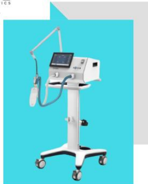
Nocca Robotics Pvt. Ltd.

A smart ventilation system has been offered by Hyderabad based Aerobiosys Technologies . It is portable, cost-effective, IoT-enabled and powered by lithium ion batteries. It operates uninterrupted for 5 hours and is both invasive and non-invasive, with a smartphone app to control the device. The system displays a real-time information of the breath pattern and other critical lung parameters. It can attach to an oxygen cylinder and can operate on its own in ambient air.