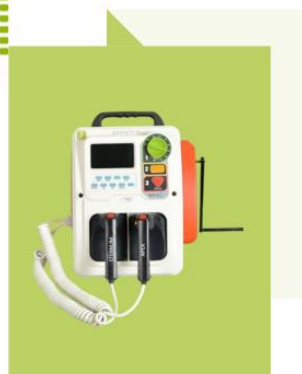
Jeevtronics Pvt. Ltd.