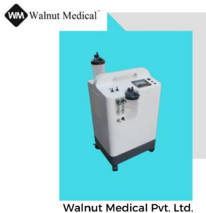
Walnut Medical Pvt. Ltd.

A portable Oxygen Concentrator by Ambala based WALNUT MEDICAL helps hospitals generate oxygen in-house. It is an intelligent closed loop system which monitors oxygen level and gives enough oxygen to the patient as per the patient need. This is the first oxygen concentrator made in India and is fitted with automated oxygen flow technology which will prevent patient suffering from hyperoxia.