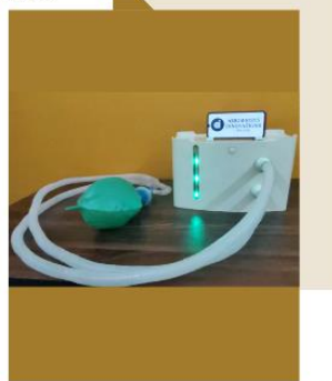
Aerobiosys Technologies Pvt. Ltd.

Catering to heat diseases , Pune based Jeevtronics has developed a device called defibrillator that restores normal heartbeat by sending an electric pulse or shock to the heart. It is used to prevent or correct an arrhythmia, a heartbeat that is uneven or that is too slow or too fast. They have developed dual powered defibrillator (grid + hand cranked), as well a battery less defibrillator for sudden cardiac arrest.