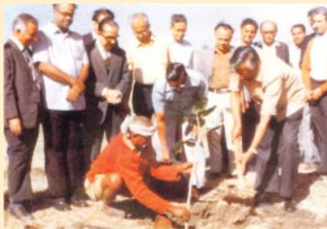
Ramanna Planting a sapling at CAT site, Indore (1983) (reproduced from Atomic Energy in India: 50 years )