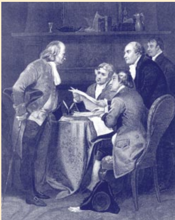
Benjamin Franklin along with four others who drafted the declaration of Independence

Moderation, Cleanliness, Tranquility, Chastity, and Humility. He tried to follow these virtues but sometimes he fell short of his own standards. He then would try to improve upon them.