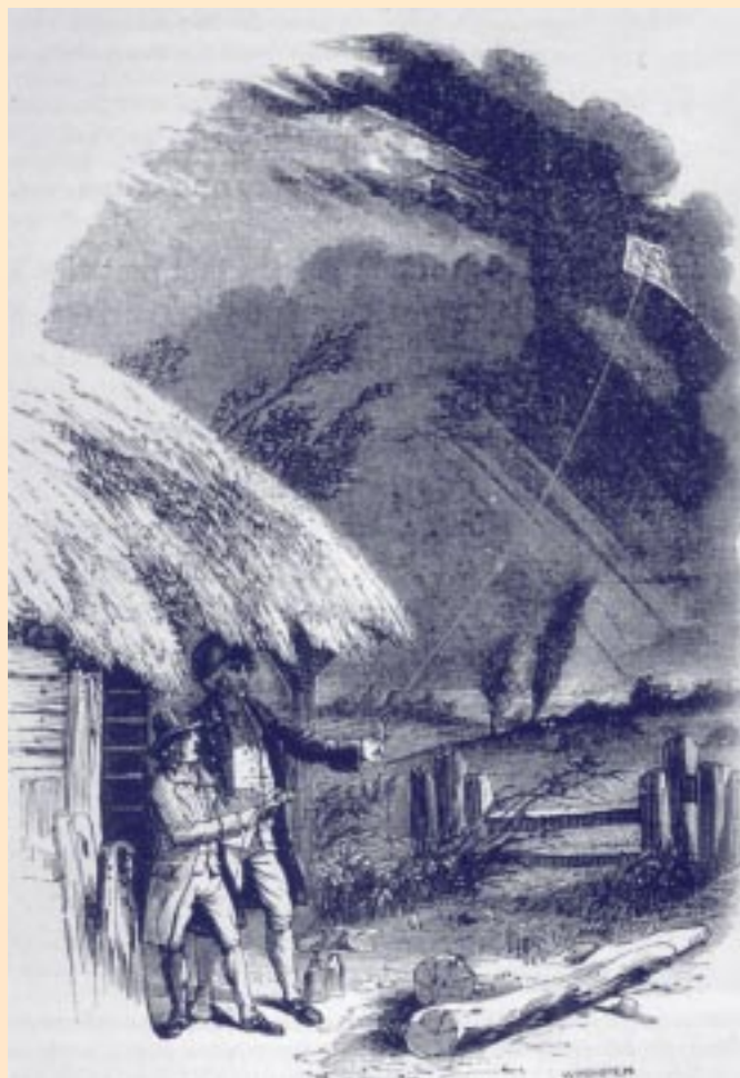
Franklin's Experiment with the kite

As a scientist, Benjamin is mainly recognized for his experiments in electricity. But his contributions