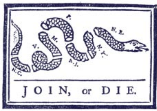
The first American cartoon, drawn by Franklin and published in the Pennsylvania Gazette, May 9, 1754

This discovery took Benjamin to a plateau of celebrity. The Royal Society honoured him by making him its member in 1756. He was later also made member of the French Academy of Science in 1772. Benjamin put his discovery to practical use by inventing the lightning conductor. A lightning conductor is a pointed metal rod, placed above the roof of large buildings, the lower end of which is buried under the ground. This protects the