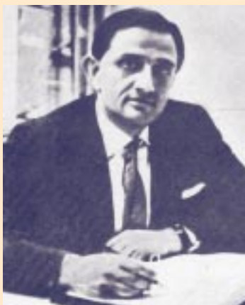
Dr. Vikram Sarabhai

Ramanna's most important contribution was the creation of a vast pool of trained scientific manpower. Thus M. R. Srinivasan, a former Chairman of the Atomic Energy Commission, wrote: “The legacy of Ramanna is that over a half century of his association with atomic energy programme, he helped build up a large pool of scientists and technologists who could take on new and challenging problems in nuclear science and technology for national progress...” To develop the skilled manpower required for this task, the BARC (DAE) Training School