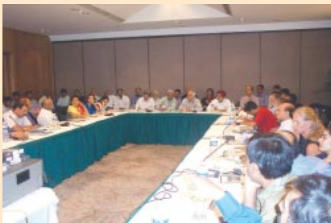
Participants at the meeting