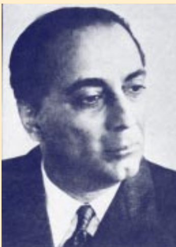
Dr. Homi Bhabha

As a part of the studies relating to the design and construction of Apsara, India's first reactor, Ramanna studied the process of neutron thermalisation in several moderating assemblies. Ramanna and his group determined the neutron diffusion and slowing down constants in water and beryllium oxide by using a pulsed neutron source. The neutron spectra emerging out of these moderating assemblies were also studied. Apsara, once commissioned, made intense thermal neutron beams available for basic research. This prompted Ramanna to undertake a programme of experimental investigations of secondary radiations emitted in thermal neutron-induced fission of U235. Ramanna and his coworkers measured the energy and angular distributions of prompt neutrons and gamma rays emitted by fission fragments. Such measurements