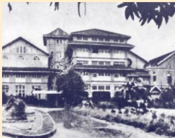
The first home of the Tata Institute of Fundamental Research (TIFR), Bombay

he took the initiative for setting up a Centre for Advanced Technology at Indore, devoted to the development for advanced accelerators, lasers and other related technologies. He helped to establish the Variable Energy Cyclotron Centre (VEC) at Kolkata. He was the founder-Director of the National Institute of Advanced Studies (NIAS) at Bangalore established by JRD Tata. He was