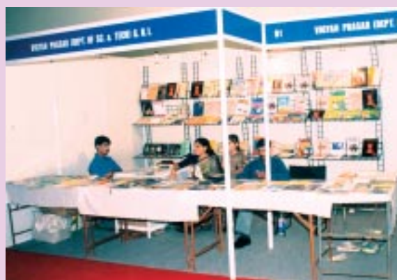
Vigyan Prasar participated in the Times book fair held at Mumbai from 21-25, October 2004