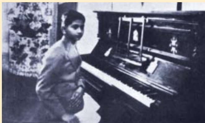
Raja Ramanna, as a boy of eleven (reproduced from Raja Ramanna's autobiography "Years of Pilgrimage")

Ramanna is no more. We Indians must honour his memory. But then as P. K. Iyengar has pointed out, Ramanna's "more important legacy is his uncompromising belief in intellectual clarity and rational thinking in every facet of life, and his unwavering belief (which he inherited from Jawaharlal Nehru and Homi Bhabha) that the nation could progress only by