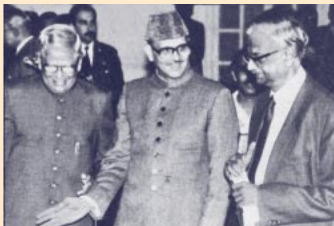
Raja Ramanna with President R. Venkataraman (extreme left) and Prime Minister V.P. Singh (centre) at his swearing-in as Minister of State for Defence

Ramanna directly or indirectly helped to build up a number of institutions in the country. In the early 1980s