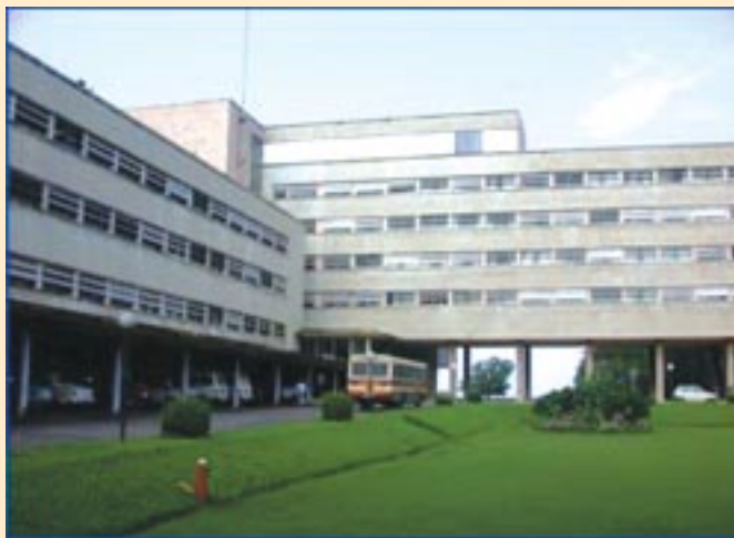
The present premises of Tata Institute of Fundamantal Research

for unmarried scientists of TIFR. Bhabha, who had known Ramanna's interests and abilities in music, allotted him two adjacent rooms in the top-most fourth floor of the hostel, one for Ramanna and the other for his piano. The ground floor of the hostel became the nuclear physics laboratory of Ramanna, where he started his work on nuclear fission and scattering." Recalling his own impression of TIFR at the time of his joining Ramanna wrote in autobiography: "I joined the TIFR when it was in its fifth year and the initial problems