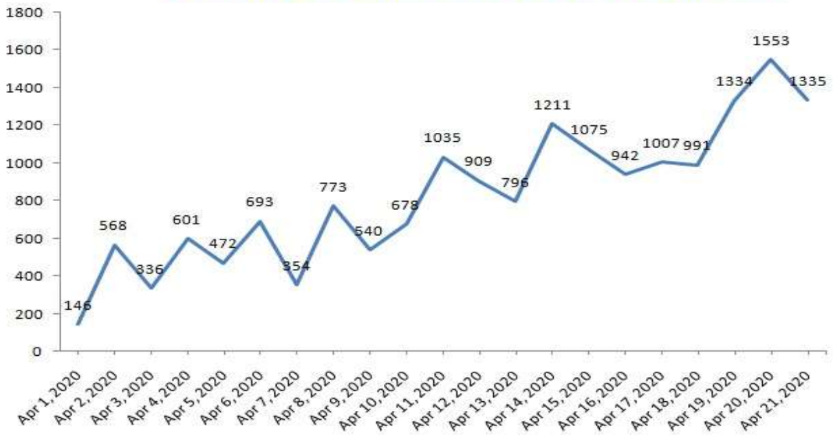
Daily new confirmed COVID-19 cases in India

Government of India is taking all necessary steps to reduce the spread of the virus in our country. The most important factor in preventing the spread of the virus locally is to empower the citizens with the right information and taking precautions as per the advisories being issued by Ministry of Health & Family Welfare. As per Indian Council of Medical Research (ICMR), 462,621 samples from 447,812 individuals have been tested as of 21 April and 18,985 individuals have been confirmed positive. COVID-19 infection rate in India is reported to be 1.7, less than most of the affected countries.