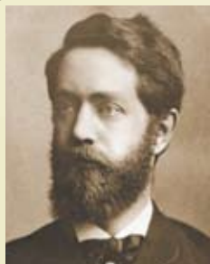
Felix Christian Klein

be extended to systems with more than two variables, as computational difficulties became insurmountable. Hilbert after failing to extend Gordan's approach developed an altogether new approach. Hilbert's approach was highly abstract. Hilbert submitted the paper proving the finite basis theorem to Mathematische Annalen . The paper was referred to Gordan, being the expert on invariant theory for the journal, for reviewing. Gordan failed to recognise the importance of Hilbert's work. Thus, he sent his comments to the editor of the journal, Felix Christian Klein (1849-1925) expressing his apprehension on