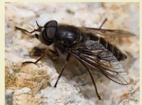
Horseflies deliver nasty bites, carry disease, and are a horse's most irritating enemy.

They had expected that the striped pattern would attract an intermediate number of flies between the white and dark painted boards, but were surprised to find that the striped board attracted the least number of horseflies. When the researchers measured the stripe widths and polarisation patterns of light reflected from real zebra hides, they found that the zebra's pattern correlated well with the patterns that were least attractive to