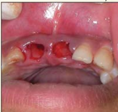
Following the injury

Most people, however, tend to be casual about the loss of one or more molars, the teeth at the back of the mouth, which help chew food. This can have grim consequences. The jawbone suffers, and begins to deteriorate. The accelerated bone loss makes it softer and more vulnerable. Over time, the loss is compounded: the remaining teeth begin to shift in an attempt to fill the newly created space caused by the tooth loss. This shift produces a malocclusion: the upper and lower sets of teeth no longer match with each other. Normal chewing becomes difficult and the victim may suffer a sore jaw and unexplained headaches. As more teeth are lost, the remaining teeth must work harder. This extra burden accelerates their decay and demise.