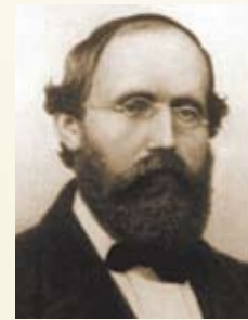
Friedrich Bernhard Riemann

Hilbert compiled the list of 23 unsolved problems which set the course of 20th century mathematical research. The list is regarded as the most successful and deeply considered compilation ever to be produced by an individual mathematician. He launched the problem set in a talk presented at the International Congress of Mathematics held in Paris in 1900. The title of his talk was "The Problems of Mathematics." At the Congress he described fewer than half the problems and in his subsequent publication he extended the list up to 23. The list later became known as '23 Problems of Hilbert'.