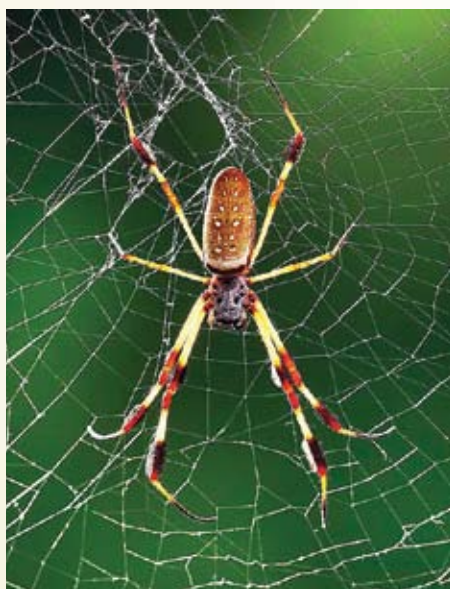
Nephila clavipes , the golden orb spider, in its web

The spider webs are made from multiple silk types, but two types, known as viscid silk and dragline silk are most critical to the integrity of the web. Viscid silk is stretchy, wet and sticky, and it is the silk that winds out in increasing spirals from the web centre. Its primary function is to capture prey. Dragline silk is composed of a suite of proteins with a unique molecular structure