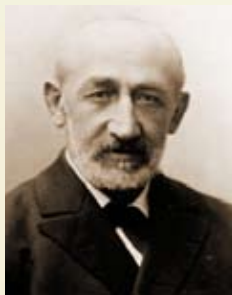
Paul Albert Gordan

Hilbert's first major work in mathematics was on invariant theory. In 1888, he proved his famous basis theorem. Earlier Paul Albert Gordan (1837-1912) had proved the finite basis theorem for binary systems. However, Gordan had used a highly computational approach and his work could not