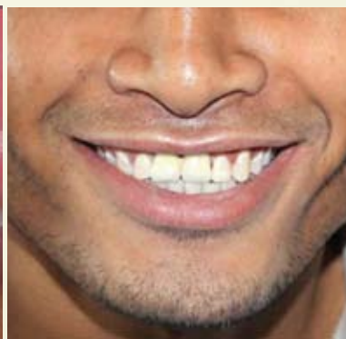
Post dental implant