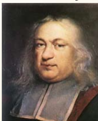
Pierre de Fermat

Despite efforts by all leading mathematicians, there is no formula for computing the n^{\text{th}} prime. But if we know the value of a prime, then can we calculate the very next prime? In other words, if P_n is the n^{\text{th}} prime, then where is the next prime P_{n+1} ? In 1845 mathematician Joseph Bertrand conjectured that if n \geq 2 , then at least one prime exists