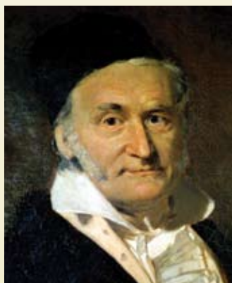
Johann Carl Friedrich Gauss