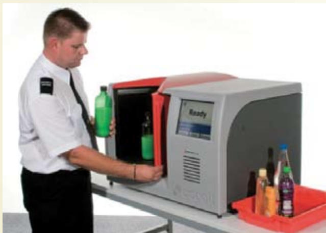
A scanner using spatially offset Raman spectroscopy can reveal the contents of packaged items that may conceal explosives or drugs

The present airline security rules do not allow passengers to carry liquids – a large bottle of shampoo, perfume, or even drinks