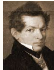
Nikolai Ivanovich Lobachevski

upon which the entire structure of mathematics could be rested. It was Hilbert who exerted the greatest influence on the development of Euclidean geometry after Euclid himself. Euclid in his classic work on geometry, Elements , made many assumptions. Some of these assumptions were not even listed by Euclid. After making a critical study of Euclid's Elements Hilbert came up with the list of 21 axioms. Hilbert not only explained these axioms but proposed that they would be the basis for the further development of the subject. Thus Hilbert provided geometry with a formal axiomatic setting. He developed geometry from a much more rigorous set of axioms than those of Euclid. Hilbert's results were published in his classic work Grundlagen der Geometrie ( The Foundations of Geometry , 1899). The book was considered so important that nine editions came out in the course of sixty years of its publication. This was part of Hilbert's attempt towards establishing a postulational basis for mathematics as a whole. Since Hilbert's first attempt the axiomatic approach has remained a permanent feature of mathematics.